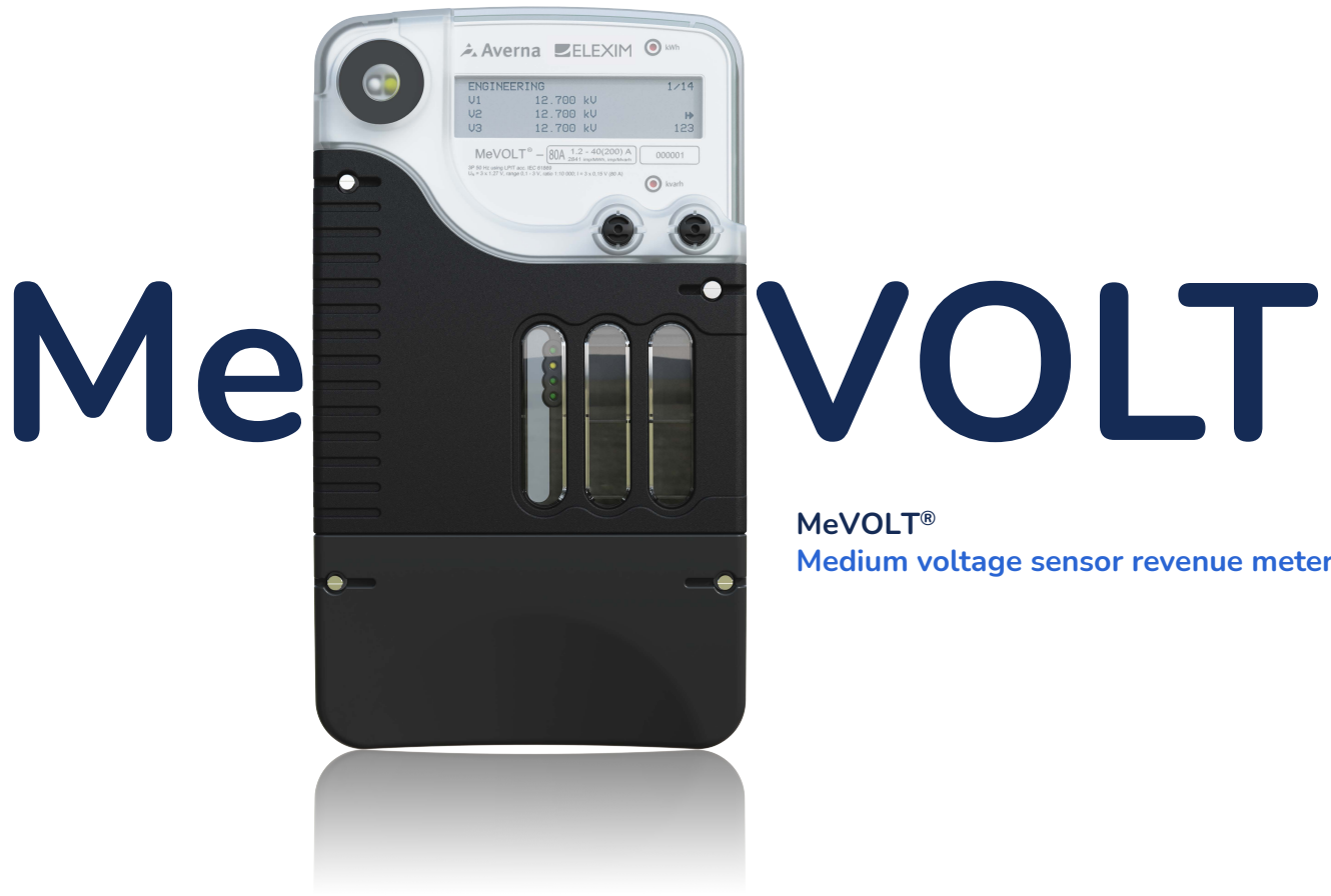
MeVOLT® Medium voltage sensor revenue meter