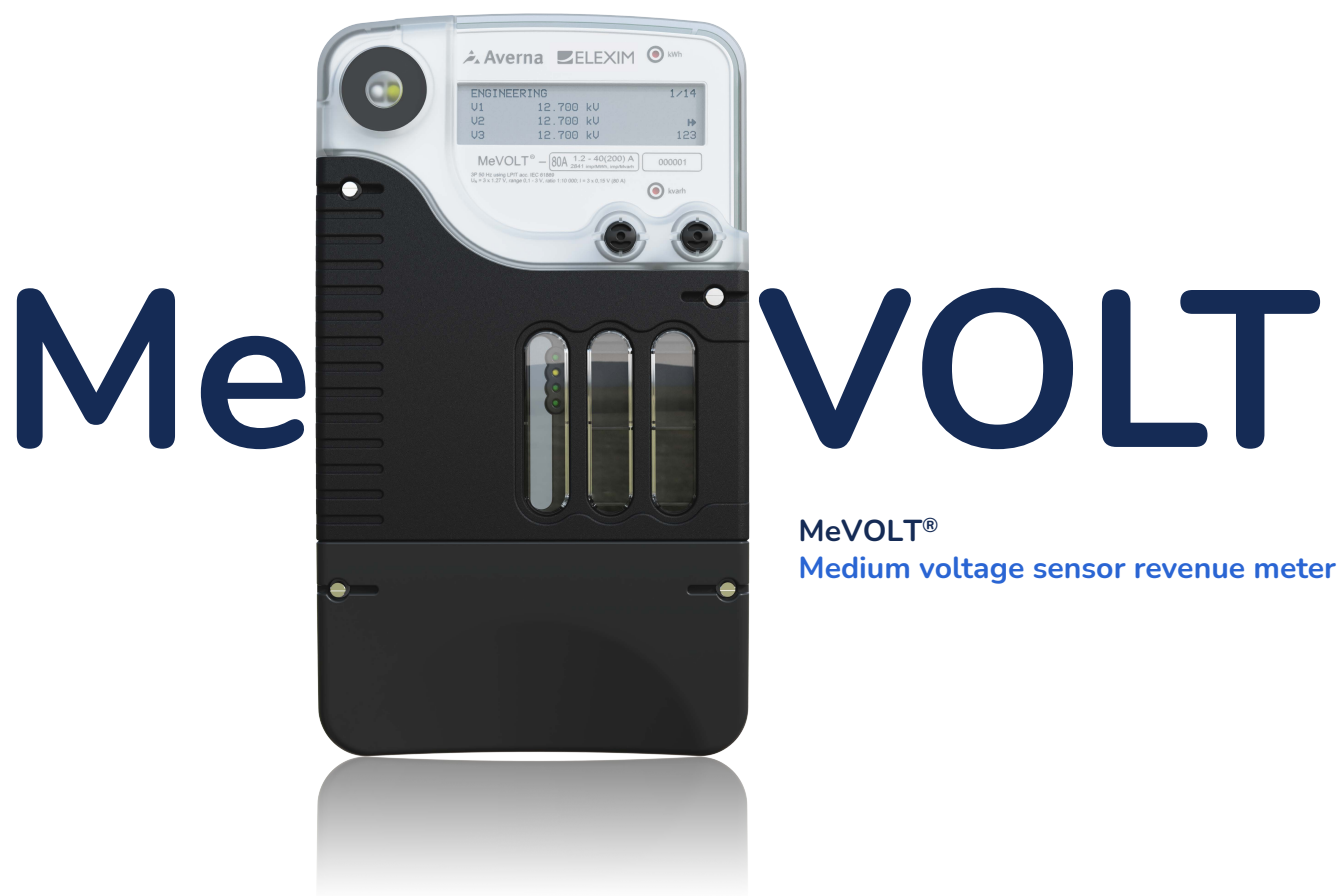
MeVOLT® Medium voltage sensor revenue meter